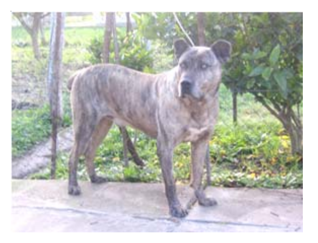
Figure 1. Male of the Uruguayan canine breed Cimarron, striped color.

The use of RAPD ( random amplification of polymorphic DNA ) markers allows to deep in the genetic characterization of breeds with conservation aims and breeding animal (4). The random amplification of polymorphic DNA fragments, known as RAPD markers, uses the PCR technique with short oligonucleotides of random sequence to detect genetic polymorphism. Among individuals, the differences in the pattern of the amplified bands (polymorphism) will be given by the bases sequences