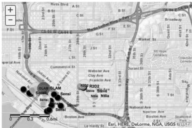
Figure 3. Map of air quality data published on news site

Based on a map (see Figure 3) that had air quality data plotted to specific locations that was published on the news website, respondents stated that this map did help them know more about air quality in the area.