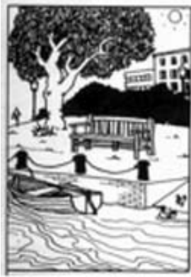
It was a beautiful summer day, the sun was shining and the birds were singing.