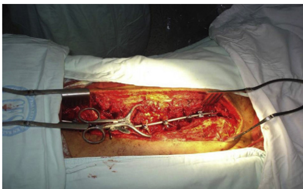
Fig. 3 – Instrumentation with pedicle screws from T3 to L3 in a single bar system.

Normal volumen hemodilution was carried out once again with colloids at a 1:1 rate, a 900 ml phlebotomy, a 1 g tranexamic acid bolus and a 10 mg/kg/h infusion. Desmopressin was administered at a 0.3 \mu g/kg single dose, monitoring and maintenance resembling the first surgery. Later into the procedure, thoracoplasty was carried out by resecting five rib segments from the hunch on the convex side of the deformity. Cosmetic improvement was satisfactory and the movement of the more displaced segments of the column was eased, which will later improve the patient's thoracic expansion capacity. Next, concavity instrumentation with pedicle screws was carried out from T3 up to L3 in single bar system. Implants and two polyester flanges were placed on the curve's apex sheets. The rib fragments were then used as an autologous graft. The estimated bleeding volume was 2200 ml (Fig. 3). When the procedure was finished, the patient remained under intubation and was moved again to the ICU. He presented severe bronchospasm as an early complication and thus required further mechanical ventilation.