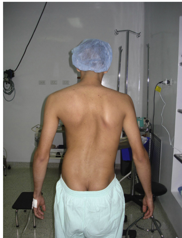
Fig. 1 – Image of the patient prior to the first surgery.