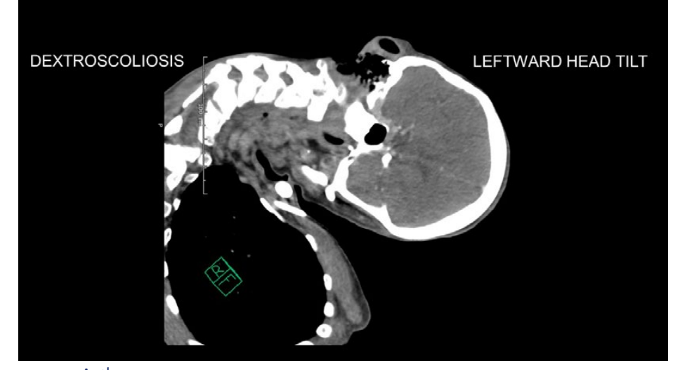
IMAGE B. Dextroscoliosis or rightward convexity of the cervical vertebral axis.