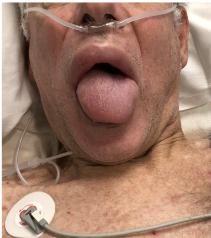
IMAGE 1. Prominent lip and tongue swelling, and Mallampati-4 airway-grading prompted an awake-fiberoptic-intubation.