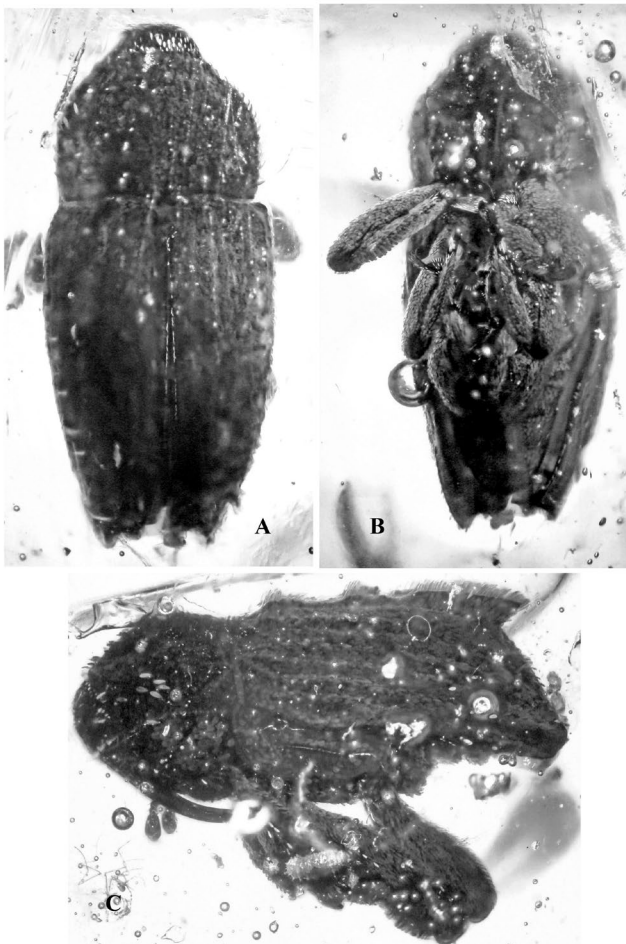
Figure 2. Conotrachelus dysaethrius sp. nov., holotype, habitus: A. Dorsal view. B. Ventral view. C. Lateral view.