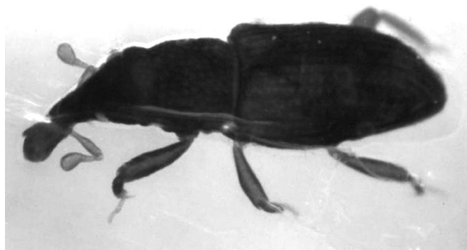
Figure 1. Stenommatius copalicus sp. nov., holotype, habitus, dorso-lateral view.

large body and longer pronotum with intervals as wide as the striae. S. copalicus sp. nov. is similar to the recent S. sulcifrons Champion, 1909 from Central America, but differs in its wider body, larger pronotal punctation, and greater convex elytral humeri.