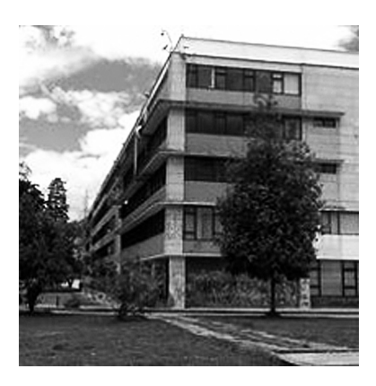
Figure 1. Faculty of Medicine, National University of Colombia. From the Alumni Association of the Faculty of Medicine (2015).

To locate ourselves and this academic milestone in time, with the that and that, without a doubt, deeply marked our history, we must remember two very important historical events that deeply marked our history that occurred in the month of November of 1988. The first was the bloody takeover of the Palace of Justice in Bogotá by a guerrilla movement followed by its bloody recovery by the Colombian military forces. The second was the colossal tragedy of Armero, Tolima caused by an avalanche that resulted from the melting of the snow cap of the Nevado del Ruiz.