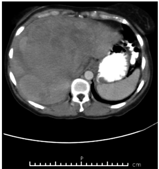
Figure 2. Abdominal CT scan with contrast shows liver with heterogeneous echogenicity, three protruding isodense lesions, with interior areas of lower density inside, located in segments 5, 7 and 8 and two smaller lesions in segments 2 and 7.

Upper endoscopy found antral erythematous gastritis and two hyperpigmented 5 mm lesions in the second portion of the duodenum (Figure 3). Biopsies found malignant proliferations of pleomorphic cells with hyperchromatic nuclei, prominent nucleolus and abundant melanin