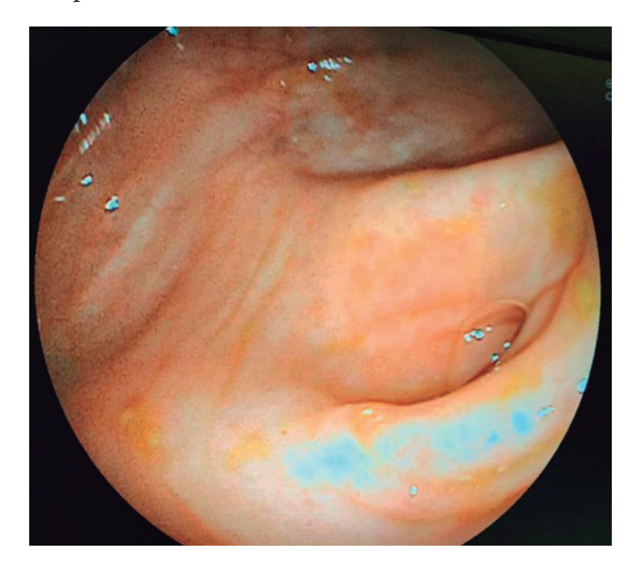
Figure 1. Colonoscopy view of healthy appendicular orifice

The patient was discharged without any evidence of any complications.