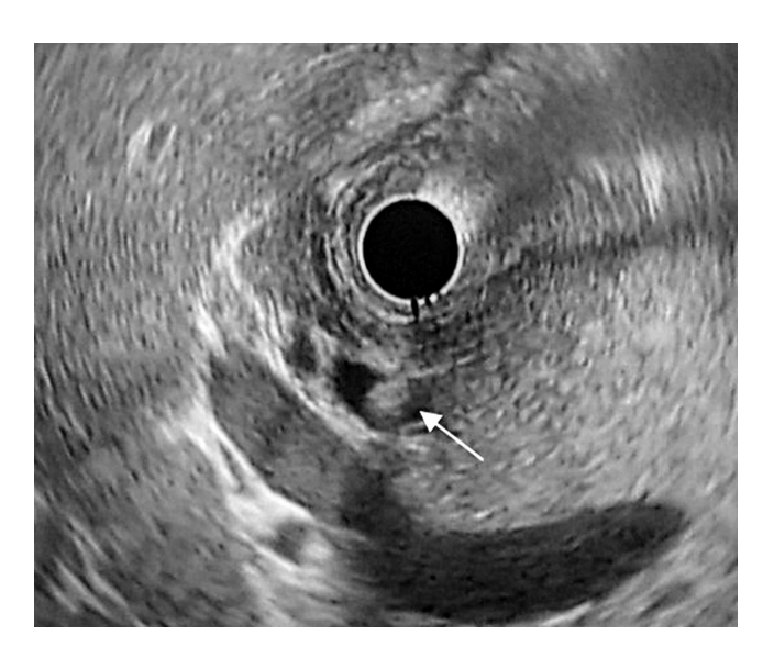
Figure 2. EUS prior to ERCP. Common bile duct of 6 mm, with a hyperechoic defect inside, which projects a posterior acoustic shadow of approximately 5 mm x 9 mm in diameter (arrow) compatible with choledocholithiasis.