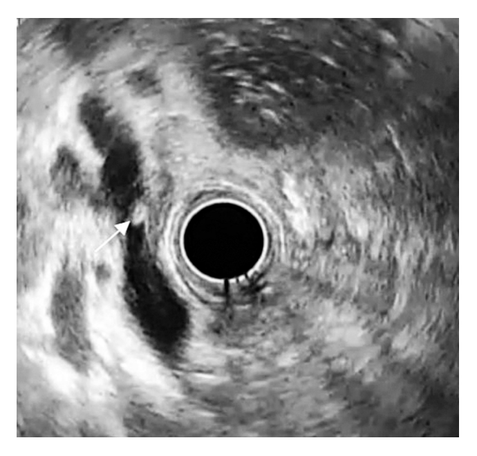
Figure 5. EUS prior to ERCP. Common bile duct dilated to 8 mm in diameter, with a hyperechoic defect in its interior of approximately 5 mm (arrow), which projects a posterior acoustic shadow compatible with choledocholithiasis. Image property of the authors.

its interior, approximately 2 mm to 5 mm, projecting a posterior acoustic shadow. The gallbladder shows cholelithiasis without cholecystitis, while the pancreas has a normal endosonographic appearance. The radial EUS is removed, then a duodenoscope is inserted ( Figure 5 ).