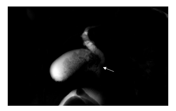
Figure 1. Cholangio-resonance. At the Vater's ampulla level, a 6 x 4 mm defect (arrow) is observed in its lumen compatible with choledocholithiasis.

ded gallbladder with multiple defects that generate a posterior acoustic shadow. In this sense, the result of the study is compatible with choledocholithiasis and cholelithiasis ( Figure 2 ). Finally, the radial EUS is removed, and a duodenoscope is inserted.