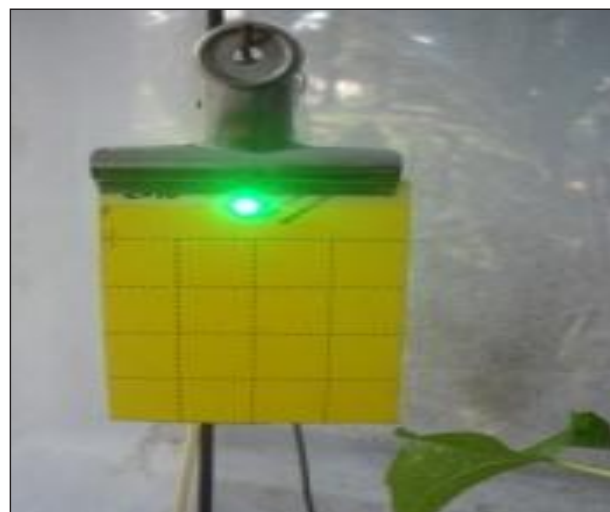
Figure 1. -Green LEDs attached to yellow sticky card

caught in each trap in each cage was analyzed using ANOVA. Further testing was made using Tukey's method with a significance level of 5% (Figure 2). All of the calculations were performed using InfoStat/Professional software, version 1.1, 2004.