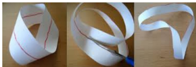
Fig. 2 – A Moebius strip, band, or loop is a sui generis mathematical object standing for the simplest non-orientable surface and was named after the mathematician August Ferdinand Möbius who discovered it in 1858. It is a surface with only one side (when embedded in three-dimensional Euclidean space) and only one boundary curve, while every classical geometric shape (either convex or nonconvex) has two sides. If a “traveler” walked along the entire length of this tape, they would return to the starting point having traversed each part of the tape (its direction is “lost” for the traveller circulating on it). If the strip got cut lengthwise, a larger one would result. If one went on to re-cut the latter lengthwise, two strips would appear one inside another, similar to chain links. This figure is included in order to illustrate which were the objects presented to the participants, as this would allow the reader a better understanding of the experimental paradigms that were used as well as their outcomes.

task and 9 participants (2.6%) correctly partitioned Moebius strip (Table 1). Gender and age did not affect scores in the visual – spatial tasks (Hinton 1 and Hinton 2). Gender and age effects are present in the Moebius strip partitioning task. The correct answer was given by 6 males (1.7%) and 3 females (0.87%). Younger participants (<25) scored higher than the >25 group. From a total of 9 correct answers, 6 (1.7%) came from the younger group and 3 (0.87%) from the older. There were 7 correct answers in the control group (the group that were in visual contact with the Moebius strip) and 2 correct answers in the experimental one (Table 1).