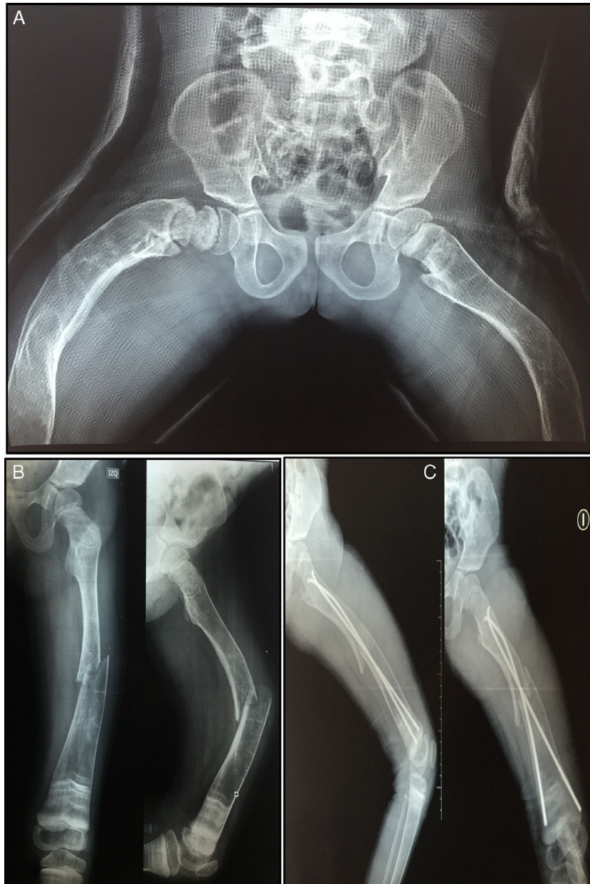
Fig. 2 – (A) Hip and lower extremities deformity, (B) diaphyseal fracture of the left femur, and (C) surgical correction of left femur fracture.

So far the patient has received three doses of denosumab with intervals of 6 months between each dose with satisfactory results, improving her quality of life significantly.