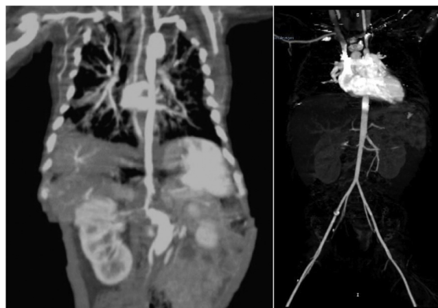
Fig. 1 – Comparison between diagnostic images: Baseline CT (left): aneurysm of the descending and abdominal aorta, renal artery stenosis. MRI of large vessels after six months of treatment (right), showing adequate calibers.

In 2018, an imaging study showed remission of the aortic spasm and stenosis of the left iliac artery. The patient was in good general condition, so she continued treatment with methotrexate and folic acid.