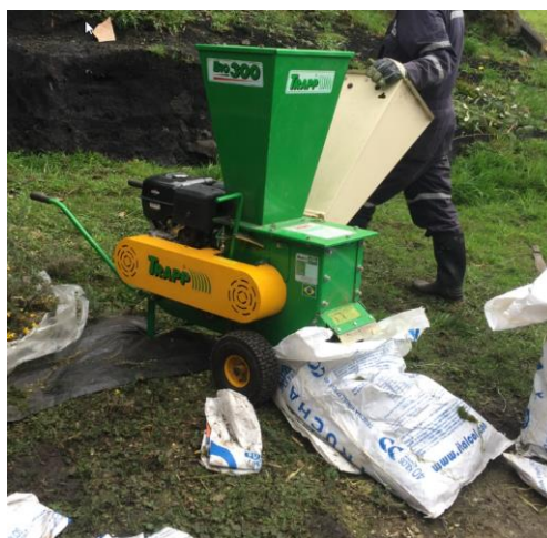
Fig. 2. “Trapp 300” Comercial chipper, used to shred and pack the samples in situ .

Taking this into account, the chipper used (Figure 2), counted on superior safeguards on the inlet shaft and with a direct exit towards the packing, in order to avoid undesired propagation at the moment of the plant's shredding.