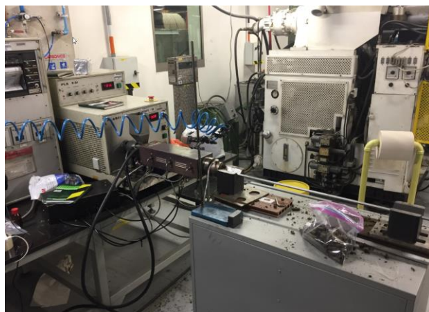
Fig. 3. Brabender PLE 331 Extruder.

Finally, the samples were sent to the CQR Coteca laboratory for the proximate and ultimate analysis.