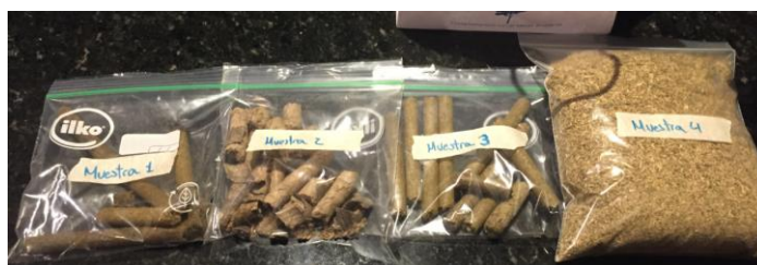
Fig. 4. Examples of extruded samples sent to the laboratory.