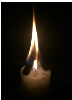
Fig. 5. Briquettes produced when being burned with a commercial candle.

The process that was carried out, even if it requires optimization in order to generate products with even more competitive characteristics, gave a general vision of the potencial that common Gorse has as a solid fuel.