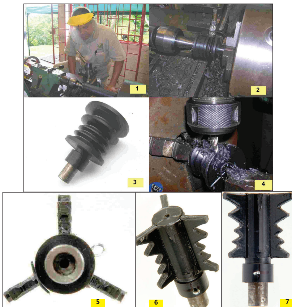
Figure 4. Construction of the beater with three toothed blades and the final product for be used in a portable coffee harvesting tool. The stages were: machining the Prolon bar (1); lathing the beater (2); coupling the shaft to the motor (3); milling each beater (4); top view (5); isometric of final product (6) and frontal view (7).