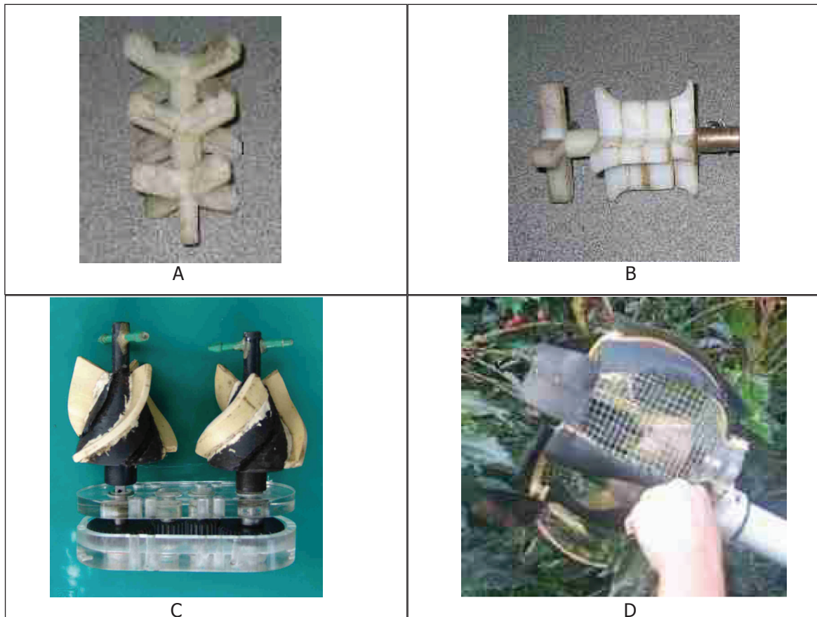
Figure 1. Beaters evaluated for the detachment of coffee berries with the ALFA tool. Phase I. Beater I (A); beater II (B) and helical beater (C and D).

The evaluated beater had two sections; one for mass detachments and one for selective detachment. The former had a truncated cone shape with a set of three helical blades. The latter had a circular