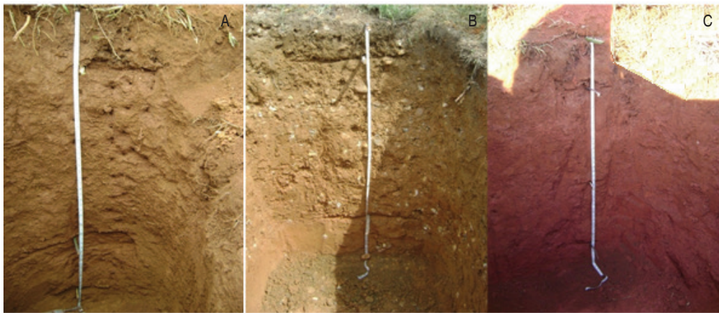
Figure 1. Typical soil profiles in three rubber planted farms of the Colombian Bajo Cauca Antioqueño region. A. Villa Gina (Tarazá); B. La Envidia (Nechí); C. La Golondrina (Caucasia).

to be variable, the soils of Villa Gina standing out for depths greater than 0.60 m, below which rubber trees usually develop most of their roots (Azabache, 2012). In the other two rubber plantations, the effective depth is considered to be sub-optimal, which implies certain restrictions that do not prevent the establishment of rubber plantations. The soils of La Envidia stand out for the vulnerability of their aggregates to external dispersing agents such as water, wind or mechanical manipulation (Pérez, 1992).