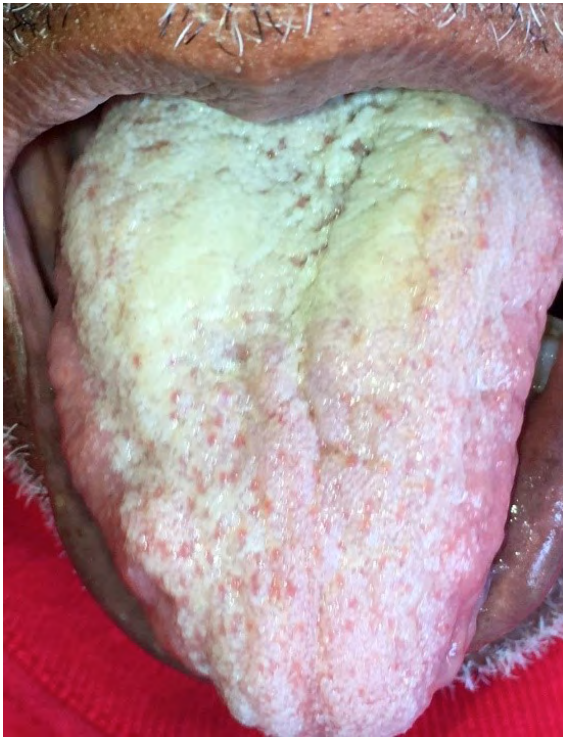
Figure 3. Clinical characteristic of an oncological patient in antineoplastic treatment with acute pseudomembranous candidiasis in dorsum of tongue, 4 months of evolution, asymptomatic and difficult to remove by scraping.

Regardless of its etiologic factor, OC is most frequently located in dorsal areas of the tongue, leading to a diffuse loss of the filiform papillae, which in turn leads to lingual atrophy and tends to manifest itself as a red plaque often accompanied by significant changes in taste, or dysgeusia. 57 Lesions on the palate, edentulous alveolar ridges, gingiva, and floor of the mouth are less frequent. PSC may be accompanied with burning pain, sudden changes of taste while eating and halitosis when food is not consumed. AC is another clinical presentation of OC; it is often uncomfortable and can cause pain when opening the mouth. Therefore, the symptoms of OC can have a significant impact on quality of life and interaction with others, as it can affect nutrition and phonation. 1, 10, 22, 34, 57