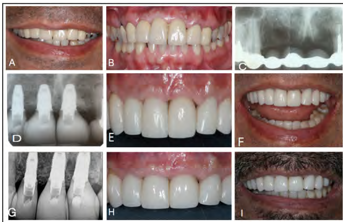
Figure 3. Case 3. A. Low smile line. B. Metal ceramic fixed partial denture. C. Initial periapical radiograph. D. Radiographic control at baseline. E. Three adjacent individual implant-supported restorations screw-retained metal free ceramic crowns at baseline. F. Smile line at base line. G, H and I. Two years follow up.

Treatment summary: He received orthodontics of his lower teeth to improve the anterior teeth relation and to close diastemas, bone and soft tissue regeneration of the anterior zone. Three all-ceramic MAISR screw-retained and individual all-ceramic crown in the abutment teeth.