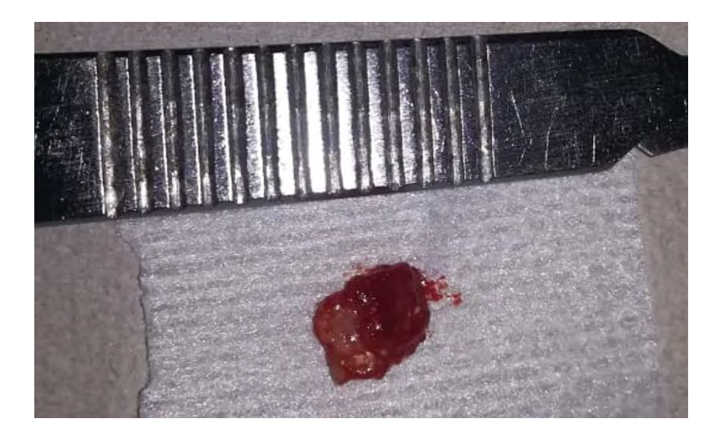
Figure 3. Macroscopic view of the resected specimen