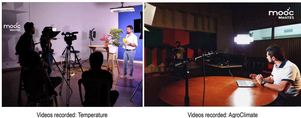
Figure 2. Videos recorded in television studio.

In addition, figure 2 (a) depicts the video recorded in the television studio of the “Temperature” unit, and figure 2 (b) shows the video recording of the “Agro Climate” unit. These videos were recorded by Ph. D. David Camilo Corrales.