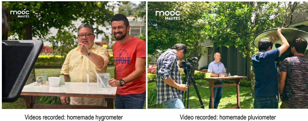
Figure 1. Videos recorded in outdoor locations.