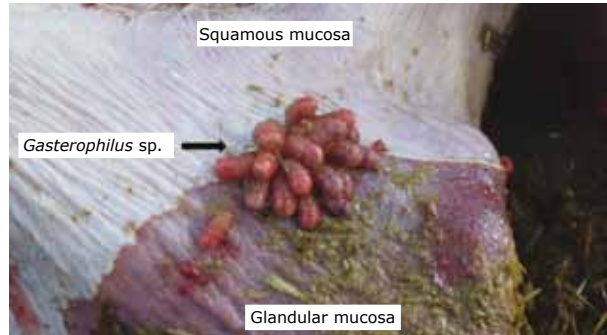
Figure 3. Donkey stomach with equine gastric ulcers syndrome with extensive erosions