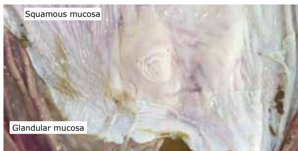
Figure 1. Donkey stomach, normal