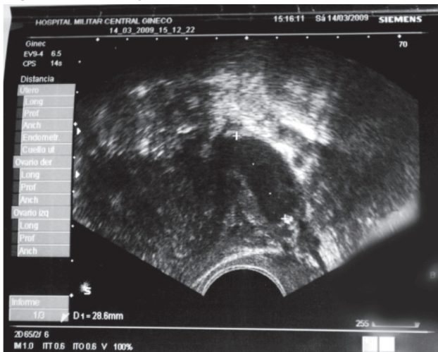
Figure 1. Transvaginal ultrasound take on March 14th, 2009

The image reveals 35x34x23 mm left ovary with 20x20 mm cystic image inside it; an elongated-mass was observed with particulate liquid inside it, resulting in a diagnostic finding of left adnexal and left hydrosalpinx masses