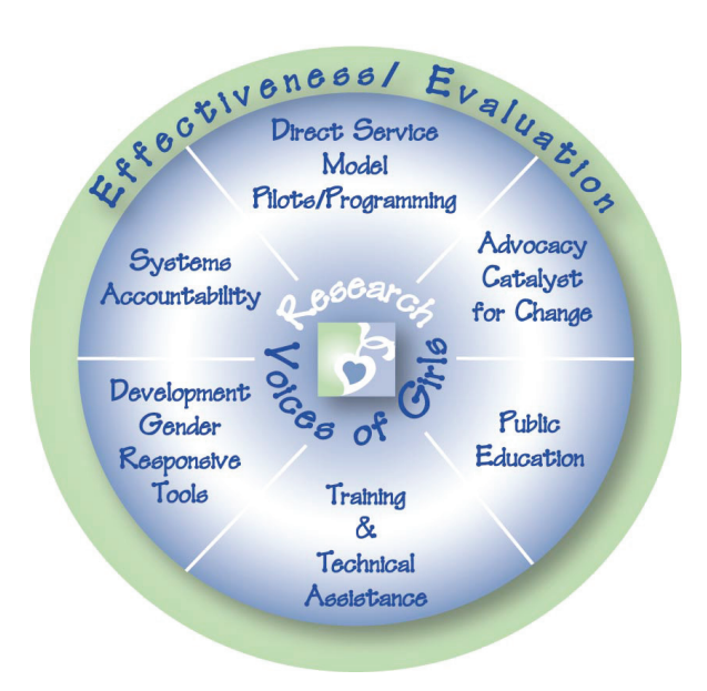
Figure 2: Gender-Responsive Model for Girls in the Justice System.

respect and understanding. Staff and girls jointly develop programs based on what they learn together. It is from this place of security that girls begin to re-envision themselves and engage their families, institutions, and communities in new and transforming ways". (Ms. Foundation for Women, 2001, p. 14)