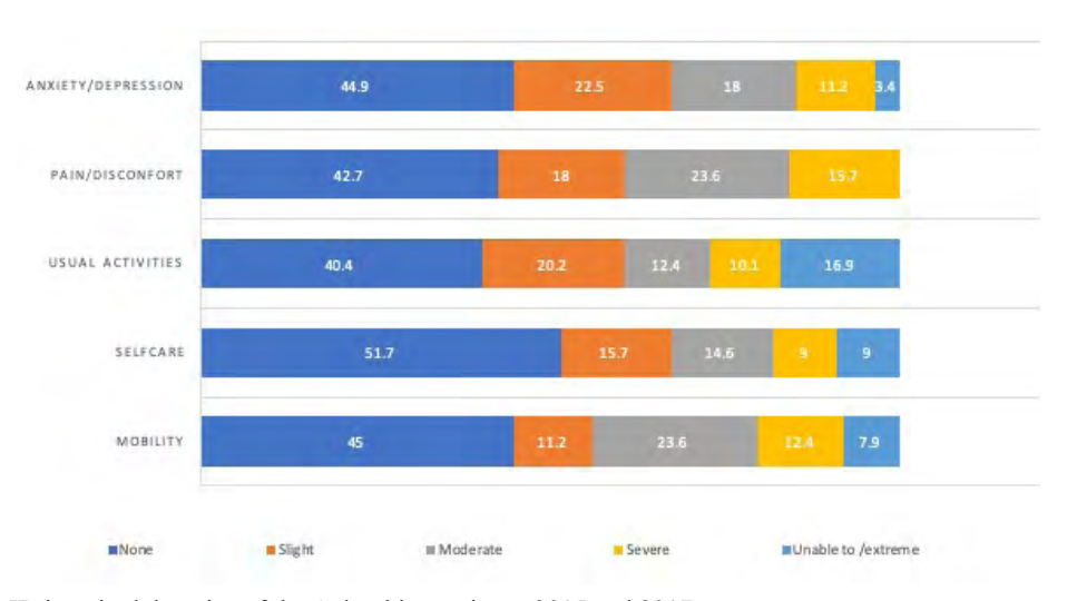
Figure 1. EQ-5D impaired domains of the Colombian patients, 2015 and 2017