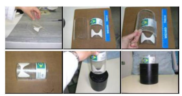
Figure 1. Sequence of preparation for the neck phantom, constructed by the IRD under the ARCAL LXXVII project.

In order to ensure the reliability of the monitoring results, it is important to periodically perform a quality control check, evaluating parameters related to sensitivity, resolution, precision, and linearity, as well as to carry out measurements of the background or natural radiation [7].