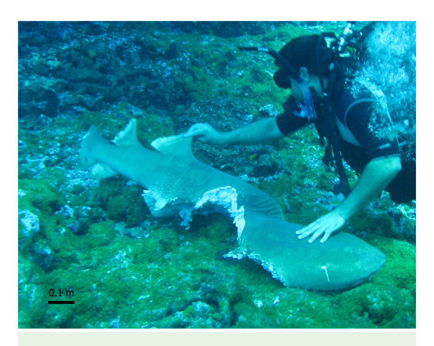
Supplement 2. The nurse shark ( Ginglymostoma cirratum ) carcass, exhibiting initial signs of decomposition on its snout and on its anal and both dorsal fins. A straight cut on its upper caudal lobe suggests it was artificially made by a sharp instrument.