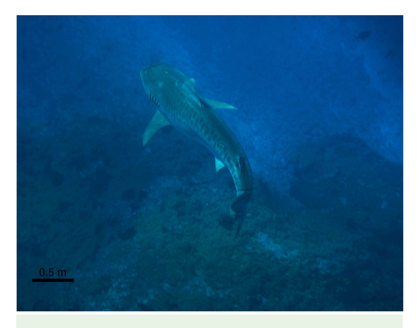
Fig. 1. A tiger shark ( Galeocerdo curier ) photographed at "Pedras Secas I", exiting the place where the nurse shark ( Ginglymostoma cirratum ) carcass was found by divers on December 18, 2009.